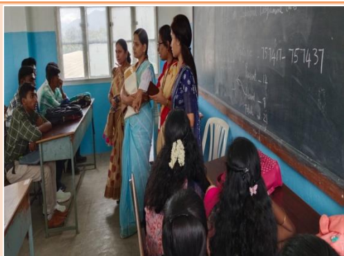
Day 1 - 20.06.2024 – Familiarization of the Department