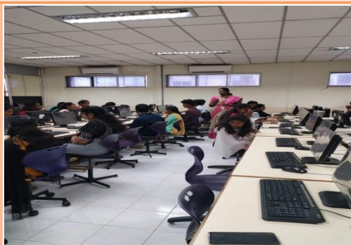
Day 4 – 03.07.2024 – LAB Tour

Kongunadu Arts and Science College (Autonomous), Coimbatore. Department of Commerce with IT Department Induction Programme June 20, 21 and July 2 nd to 5 th , 2024