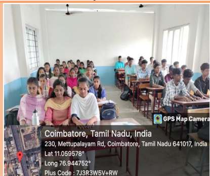
Day 5 – 04.07.2024 – Physical Activity