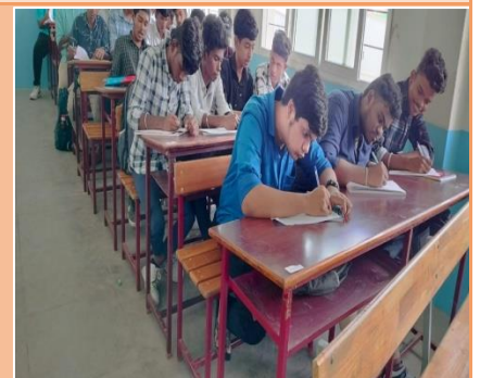
Day 6 – 05.07.2024 – Feedback Session