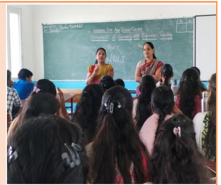
Day 3 – 02.07.2024 - NDLI

Kongunadu Arts and Science College (Autonomous), Coimbatore. Department of Commerce with IT Department Induction Programme June 20, 21 and July 2 nd to 5 th , 2024