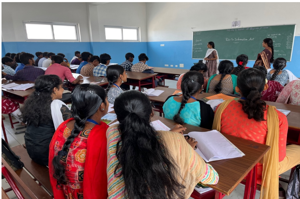
One Day State Level Workshop