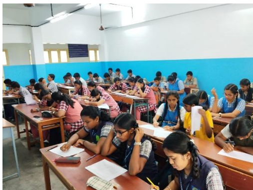
Students studying Mathematics Formulae