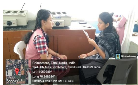
Students showcasing their speedy calculation skill in the event Manculator