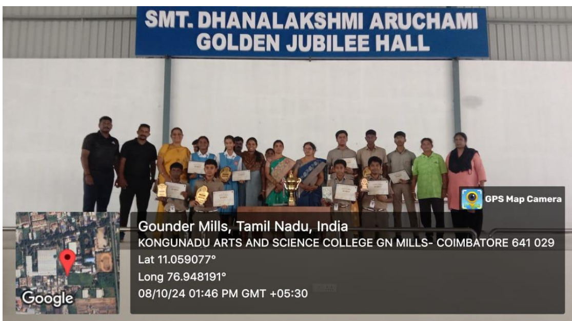
Prize winners of various events posing for a Group picture