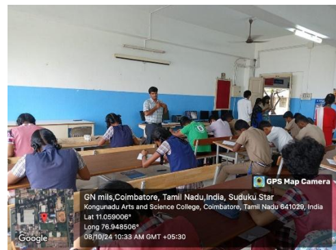
Participants solving Sudoku