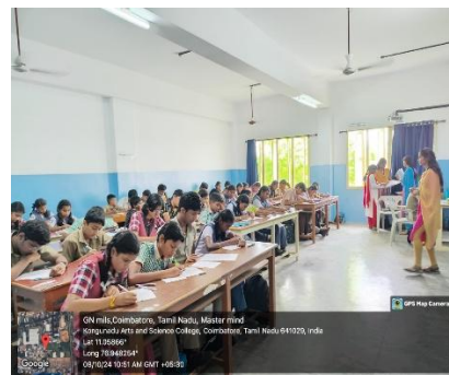
Participants taking part in the event 'Master Mind'