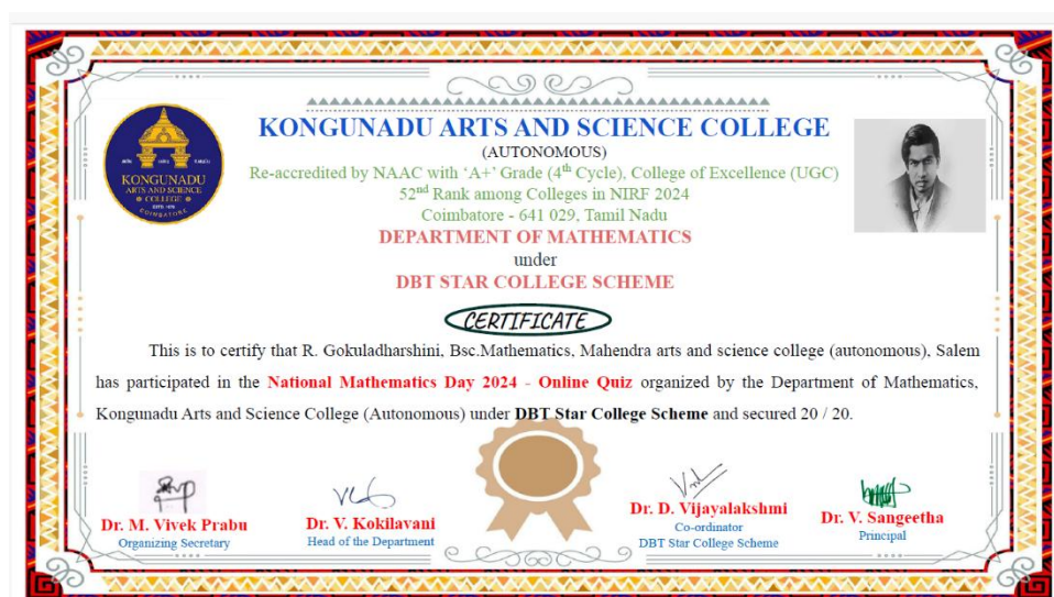
Sample of the Participation Certificate issued