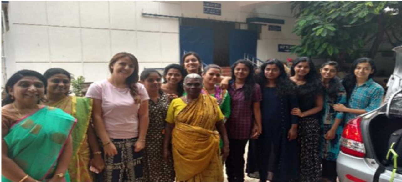
With students, staff and faculty at Kongunadu A&S College, Coimbatore (August 2018)

This trip was for collecting data on people's experiences and opinions about elephants raiding crop fields in and around Coimbatore District which will be part of my master's thesis project. I traveled to small villages near and away from the forested areas and spoke to farmers about the conflicts they were experiencing with elephants. I visited these villages with my thesis adviser and faculty members from two colleges in Coimbatore. We interviewed about 100 farmers and other stakeholders and learned the difficulties they face to protect their crops and make a living. I also learned which mitigation efforts are more effective than others.