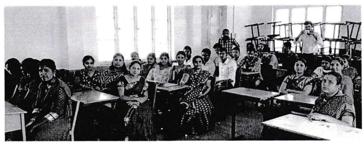
Students Alumni – 2014-15