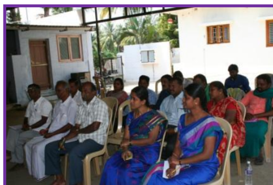
A view of farmers attending the workshop