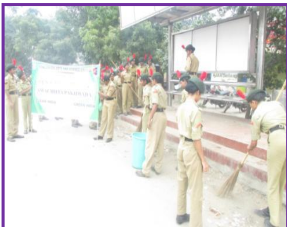
Started the cleaning process in front of the G.N. Mills Bus Stand