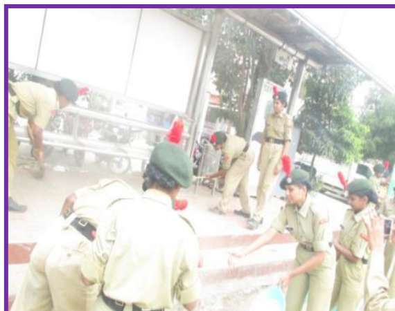
Cleaning the surroundings of the Bus Stand