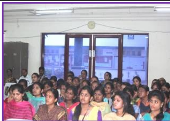
Audience at a glance