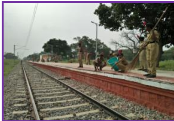
Cadets actively involved in cleaning of Railway Station