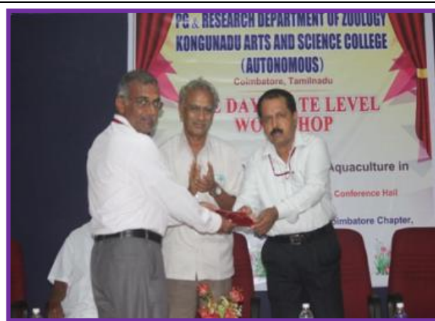
Honouring the chief guest