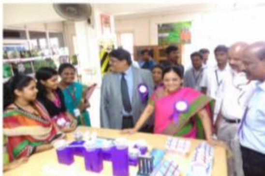
The guest and organisers saw the exhibits of the students