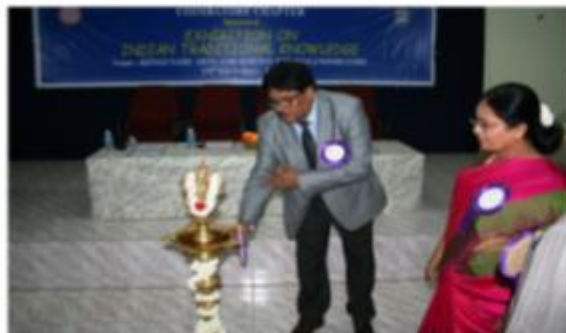
Lighting the kuthuvilakku by guests and organizers of the programme