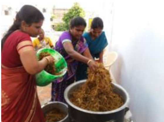
Sterilization of paddy straw substrate