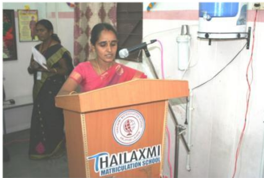
Principal, Thailaxmi school has welcomed the gathering