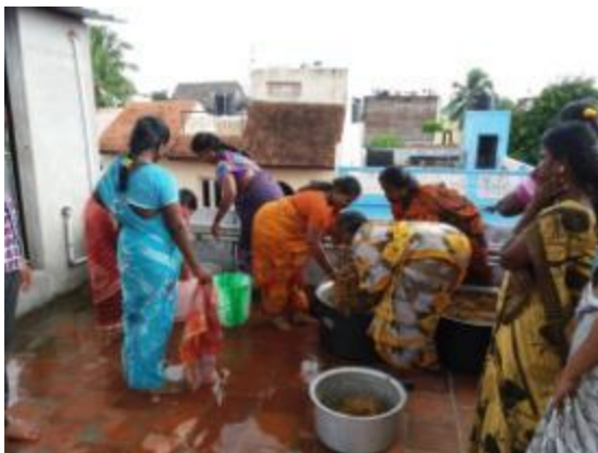
Women Self Help Group members washing the paddy straw substrate for bed preparation