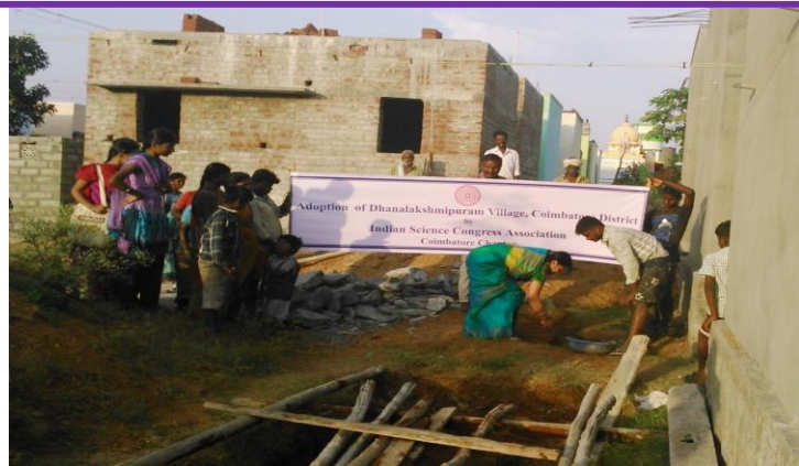
A septic tank under construction