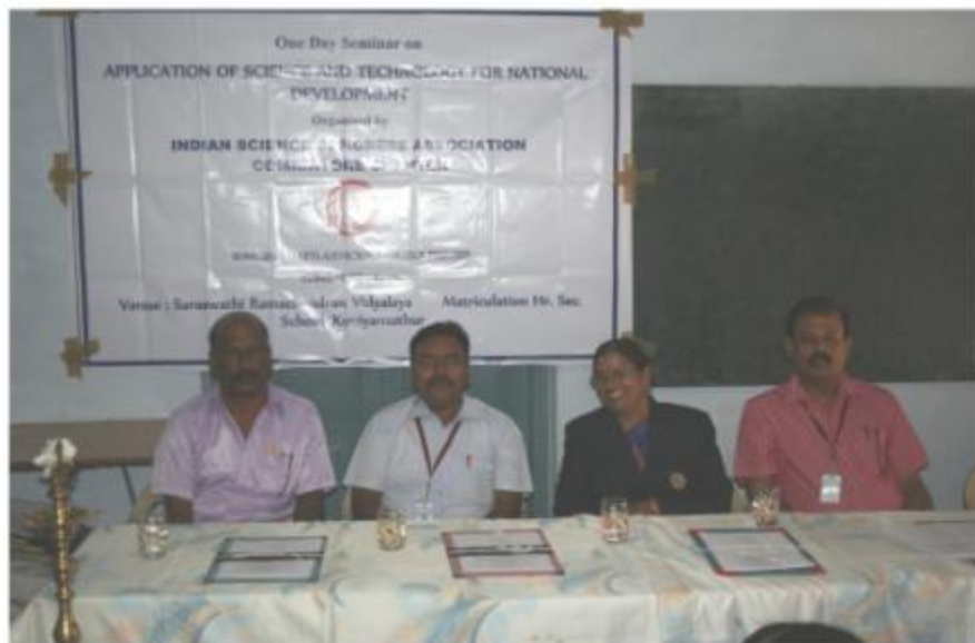
Dignitaries on the dais