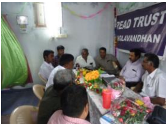
Closed meeting regarding the training programme