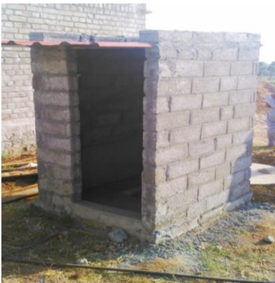
Construction of toilet is under progress