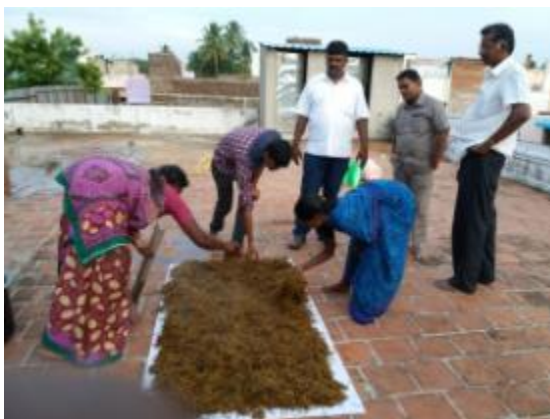
Drying of mushroom substrate by WSHG members