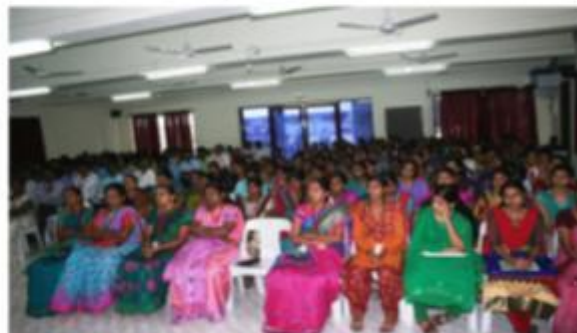
Audience during inauguration