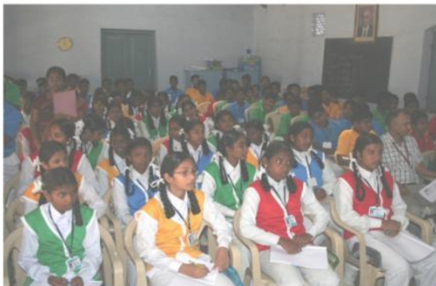
A view of school students