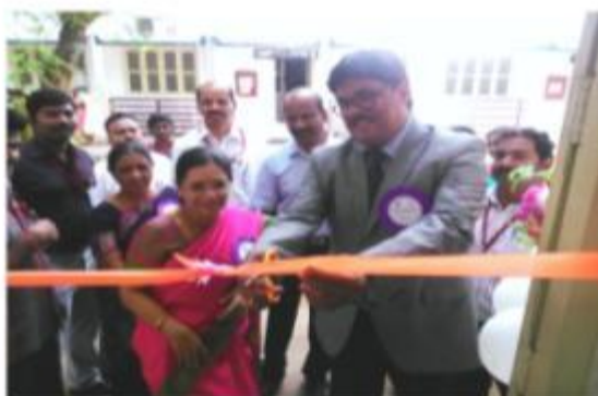
Opening ceremony of the exhibition