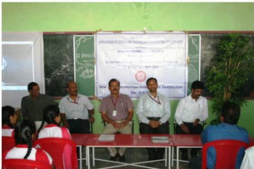
Dignitaries on the dais