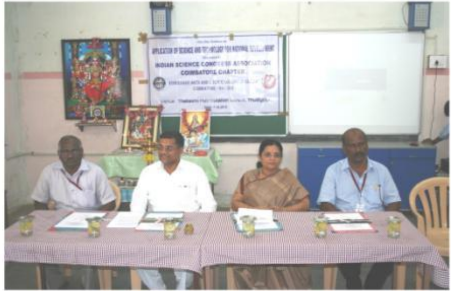
Dignitaries on the dais