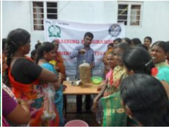
Packed bed of white oyster mushroom