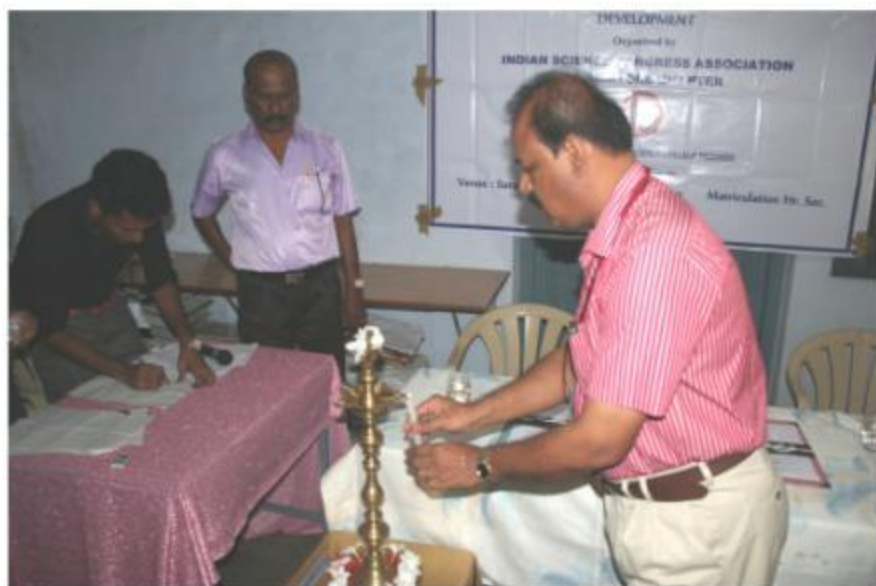
Lighting the kuthuvilakku by guests and organizers of the programme