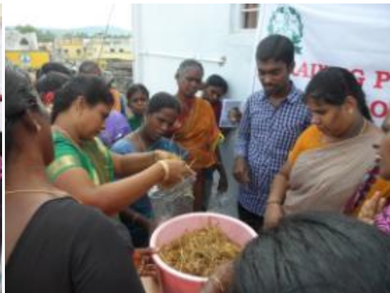
Packing of mushroom beds by WSHG members