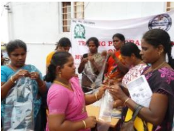
WSHG members processing the mushroom bed cover for bed preparation