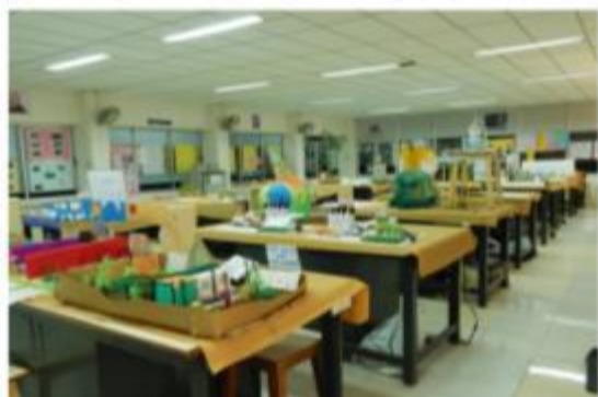
Exhibits at a glance