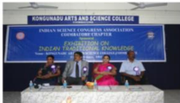
Dignitaries on the dais