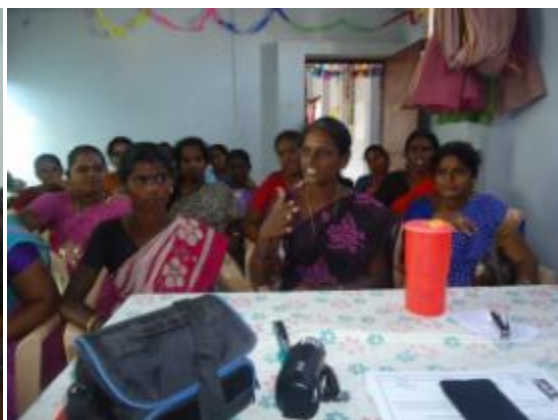
WSHG members clarifying their doubts and gets enriched with mushroom cultivation process