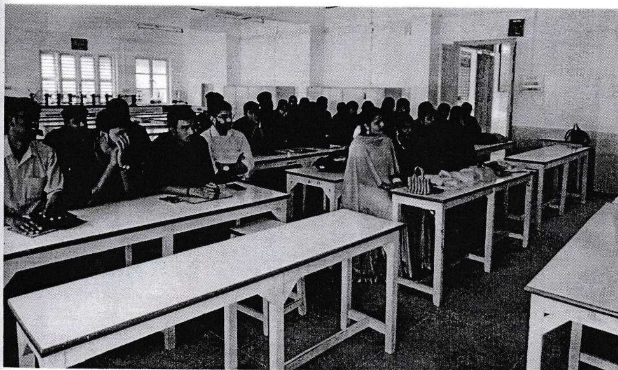
Alumni interaction (B.Sc Zoology Lab)