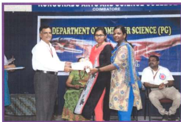
Students Received Certificates

Department of English (Aided) conducted FLORINA'18 on 19.12.2018 in which 250 students from 15 colleges took part. The competitions included Lit Parade, Solo and Group dance, Posted painting, Model making and Face painting.