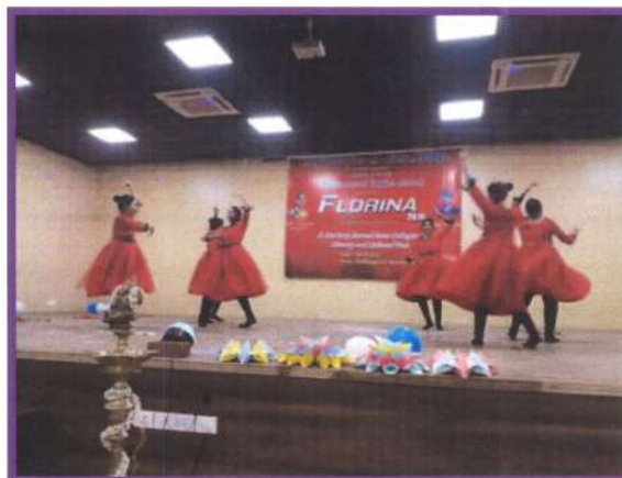
Inter-Departmental Competitive Celebration "FLORINA 2018"