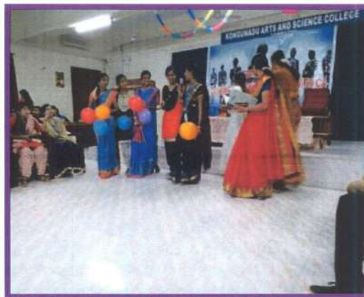
BBA CA Management Meet

Department of Computer Science(PG) conducted SAGACITY'18- State level Technical Meet on 10.10.2018. It had competitions like Debugging, Adzap, Tech Quiz, Word fun, Paper presentation and Poster presentation. The events had around 120 participants from our college and four other colleges.