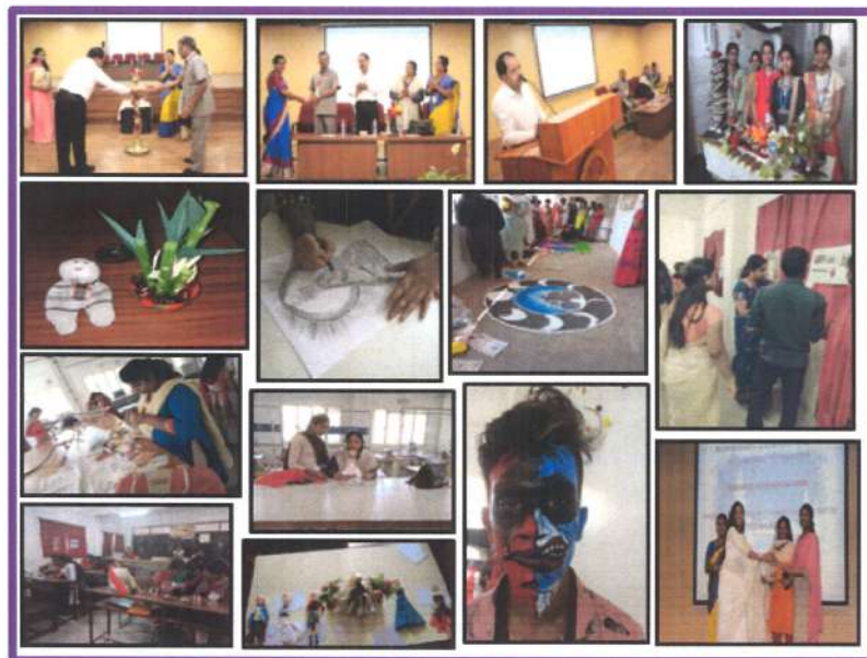
Students performances in various Events

Department of CDF conducted National level Students Symposium on 11.01.2019. The competitions conducted include Nail art, Dress a Doll, Face painting, Sketching, Rangoli, Re use waste, Jewellery design, Poster presentation, Mehandi, Dance and Designer contest. Around 250 students from 12 different colleges actively participated.