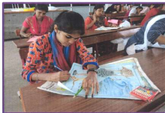
Students Participates in Various Competitions