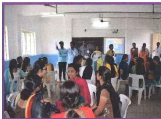
Intercollegiate Meet Photos