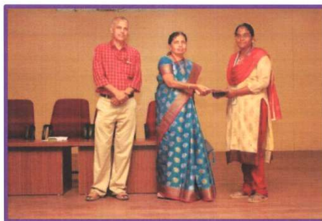
Prize distribution for inter-collegiate events