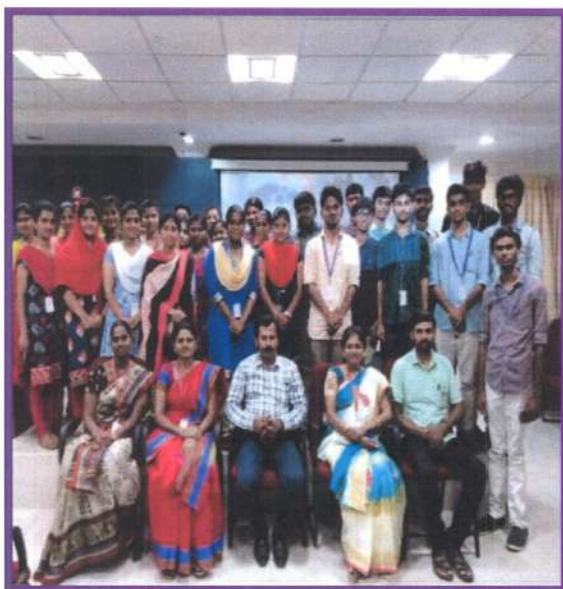
Group Photo with Chief Guest

The department of Biotechnology conducted a National level Inter Collegiate Meet for students of the agriculture science courses on 29.09.2018 and 30.09.2019. About 31 students from Kongunadu Arts and Science College, Coimbatore and other colleges participated in this event.