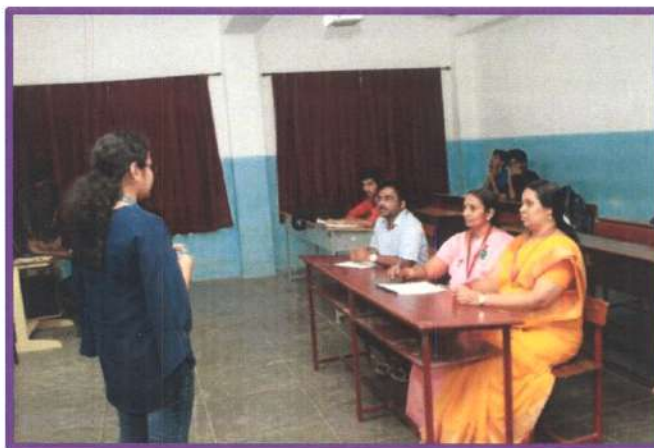
Paper Presentation by an inter-collegiate student

The Department of Physics conducted a One Day Inter Collegiate meet on 26.02.2019 which had the following competitions : Potpourri, Science fiction writing, Just a minute and Paper presentation.