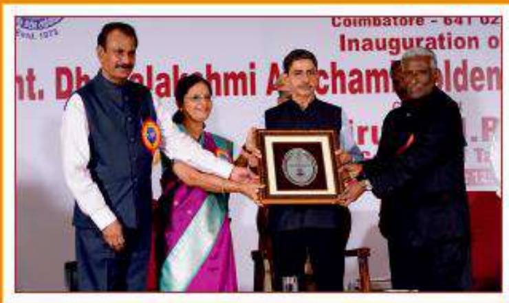
Smt.Dhanalakshmi Aruchami Golden Jubilee Multipurpose Hall Inaugurated by Thiru.R.N.Ravi, Hon'ble Governor of Tamil Nadu.