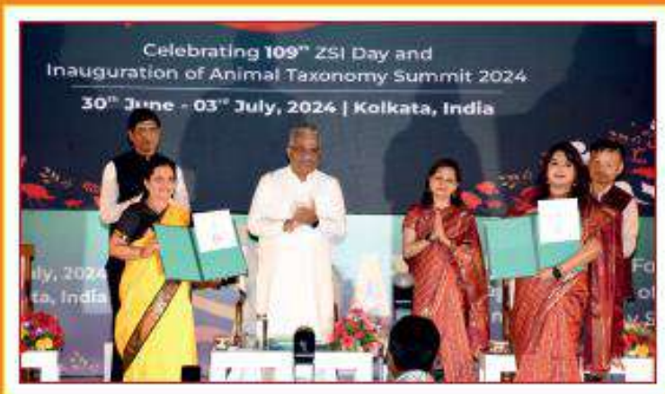
Protecting wildlife is vital for the present as well as future generations. Join hands and save the wildlife.