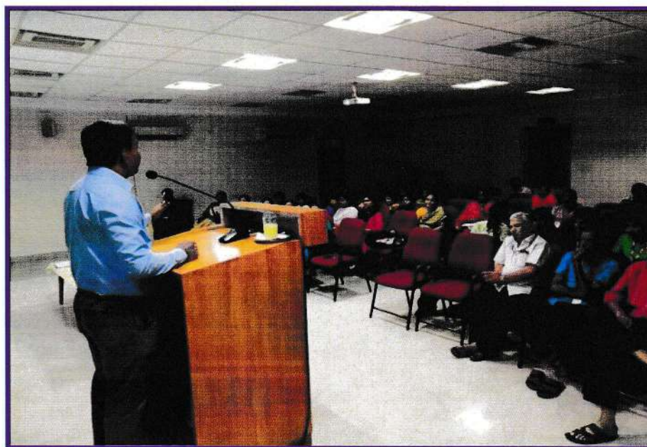
The Chief Guest Answering the Queries Raised by Participants