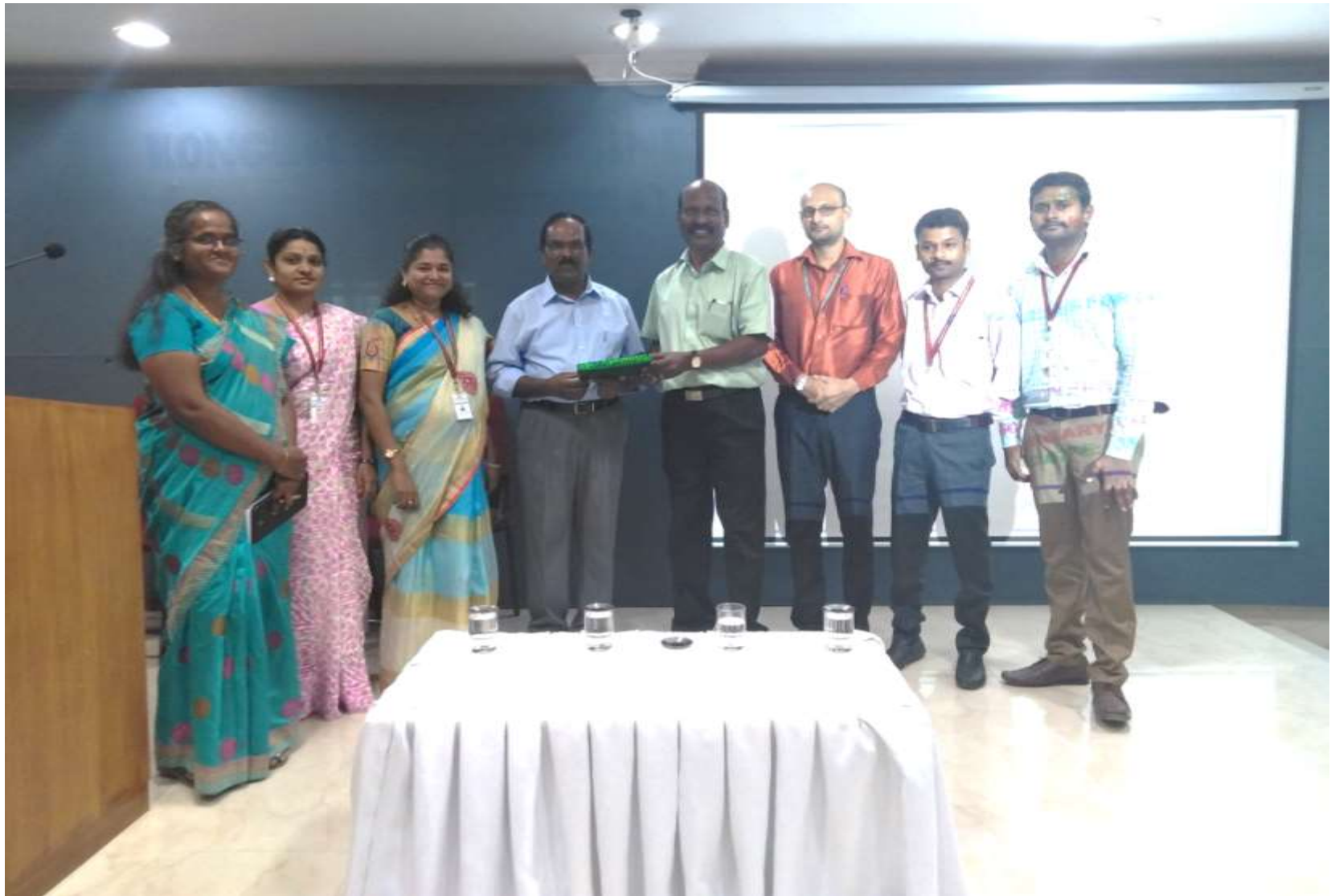
Research Networking programme on “BIOMARKERS FOR CANCER DIAGNOSTICS” 28.01.2019