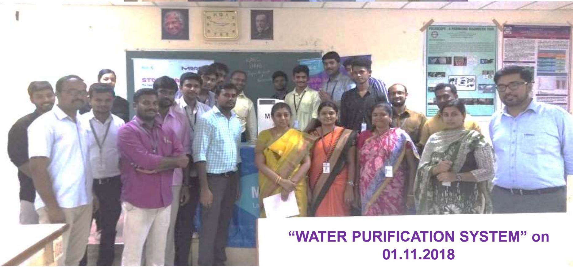
“WATER PURIFICATION SYSTEM” on 01.11.2018