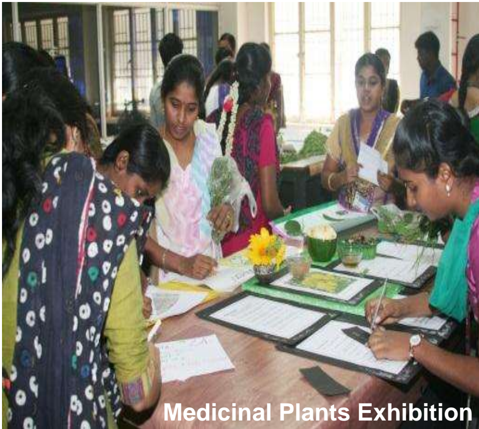
Medicinal Plants Exhibition