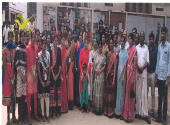
Participants & Organizer of the programme

U-Sub DEPARTMENT OF BIOCHEMISTRY Kongunadu Arts and Science College COIMBATORE-641 029