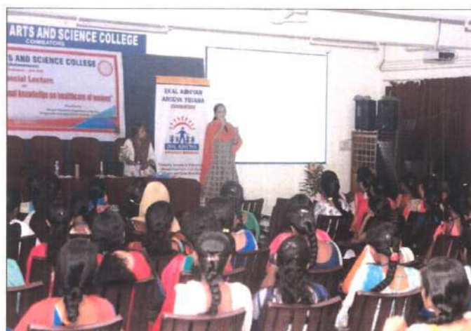
Lead lecture delivered by the Chief guest