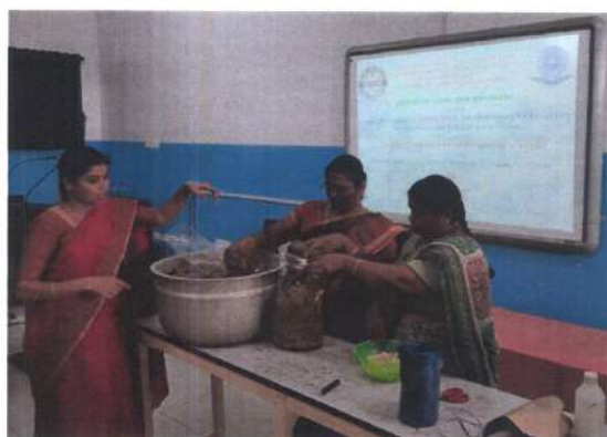
Hands on training of mushroom cultivation