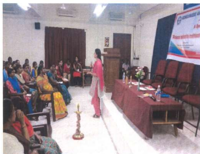
Students feedback about the special lecture