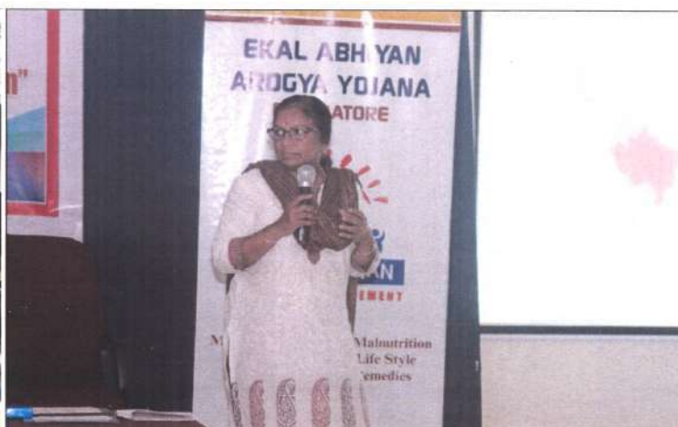
Lead lecture delivered by the Chief guest