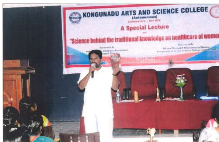
Distribution of Home Remedy booklets on Anemia to the students