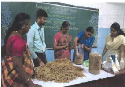
Hands on training of mushroom cultivation