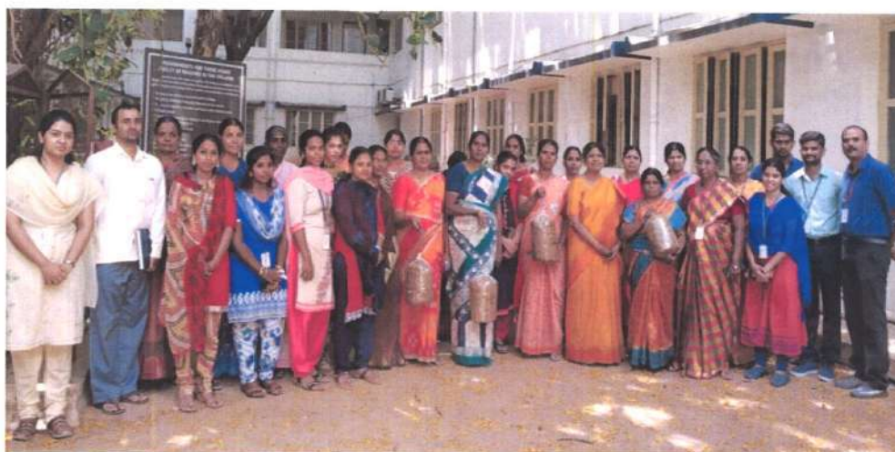
Participants & Organizers of the programme

4-Feb DEPARTMENT OF BIOCHEMISTRY Kongunadu Arts and Science College COIMBATORE-641 029