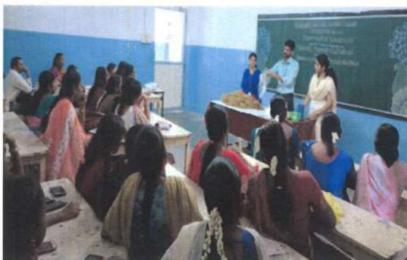
Demonstration of mushroom cultivation technology

DEPARTMENT OF BIOCHEMISTRY Kongunadu Arts and Science College COIMBATORE-641 029