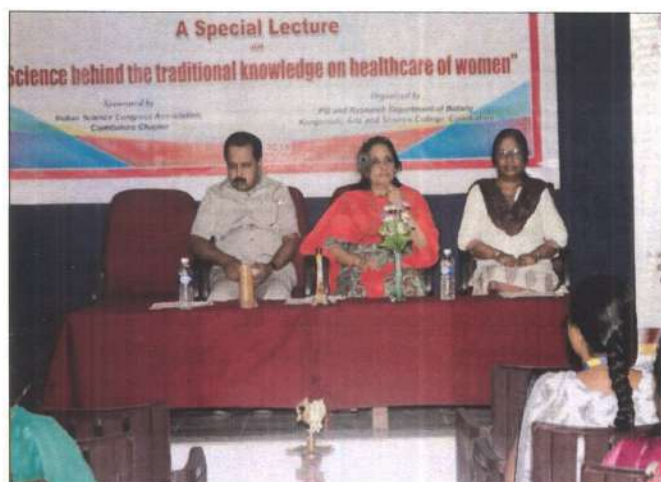
Dignitaries on the dais