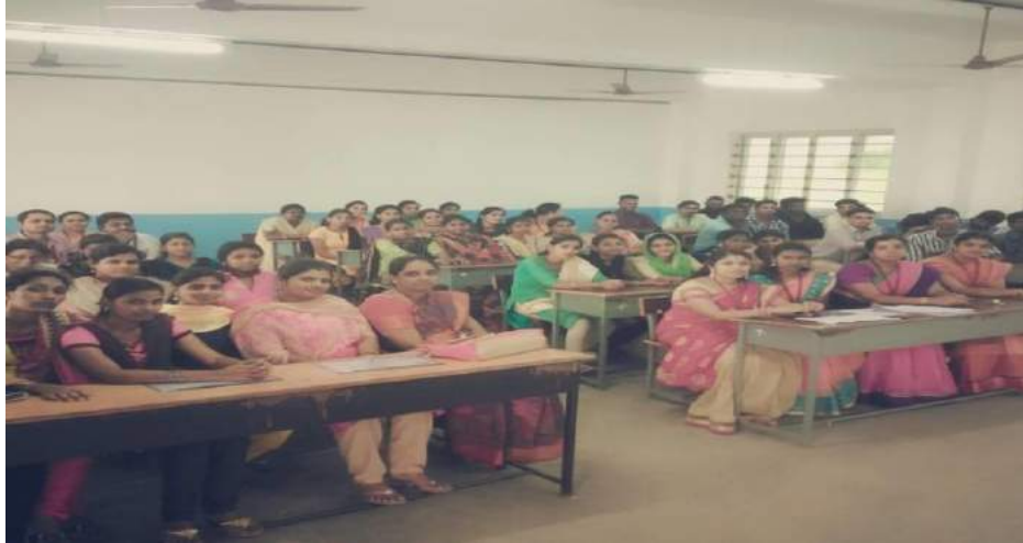
The Alumnae and the Staff Members have taken the Group Photos.