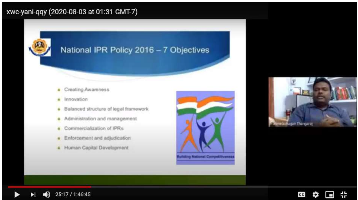
Screenshots of IPR webinar